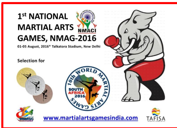
Poster promoting the NMACI National Games.

NMAC India have set their dates for their 2016 qualifying Competition for the Games in South Africa, they will take place across the first five days of August 01 st – 05 th .